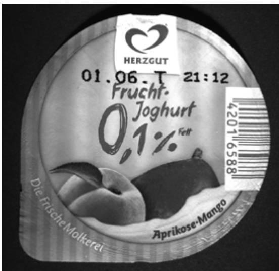
Aluminium cap for yoghurt pot under white light

Apart from its usefulness with coloured test objects, this is not the only place where longwave infrared radiation has an important role to play. Infrared lighting can also be used to look inside certain kinds of materials. This technique is used in inspections using backlight systems on conveyor belts, for example. Infrared radiation can also be used in combination with specialised filters to attenuate (block) extraneous light. In chapter 3, this technique will be looked at in detail.