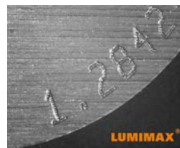
Partial bright field

Bright field lighting is a type of reflected-light lighting. Imagine the object plane as a perfectly flat reflector. If the lighting is arranged so that light is reflected directly back into the camera, this is referred to as a bright field arrangement.