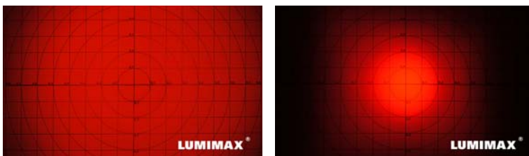
High Power lighting: left with 49° lenses, right with 10° lenses (at a working distance of 1.5 m)

For large working distances and strongly absorbent objects, High Power LED lighting is especially suitable. Very high intensity LEDs, combined with integrated controller and performance electronics guarantee luminous intensities of well over 1 million lux in flash operation and offer excellent lighting for the objects under inspection – even at a working distance of several metres. Since the lenses in front of the LEDs can be swapped out in LUMIMAX® High Power LED lighting, the lighting setup can be adjusted to meet a broad range of requirements. By using lighting with a tight beam angle, for example, objects several metres away can still be lit at a high luminous intensity. A broad beam angle, on the other hand, creates homogeneous lighting even at shorter distances, while also providing high-intensity lighting for larger objects.